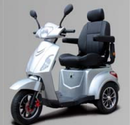
ALSO AVAILABLE IN SILVER