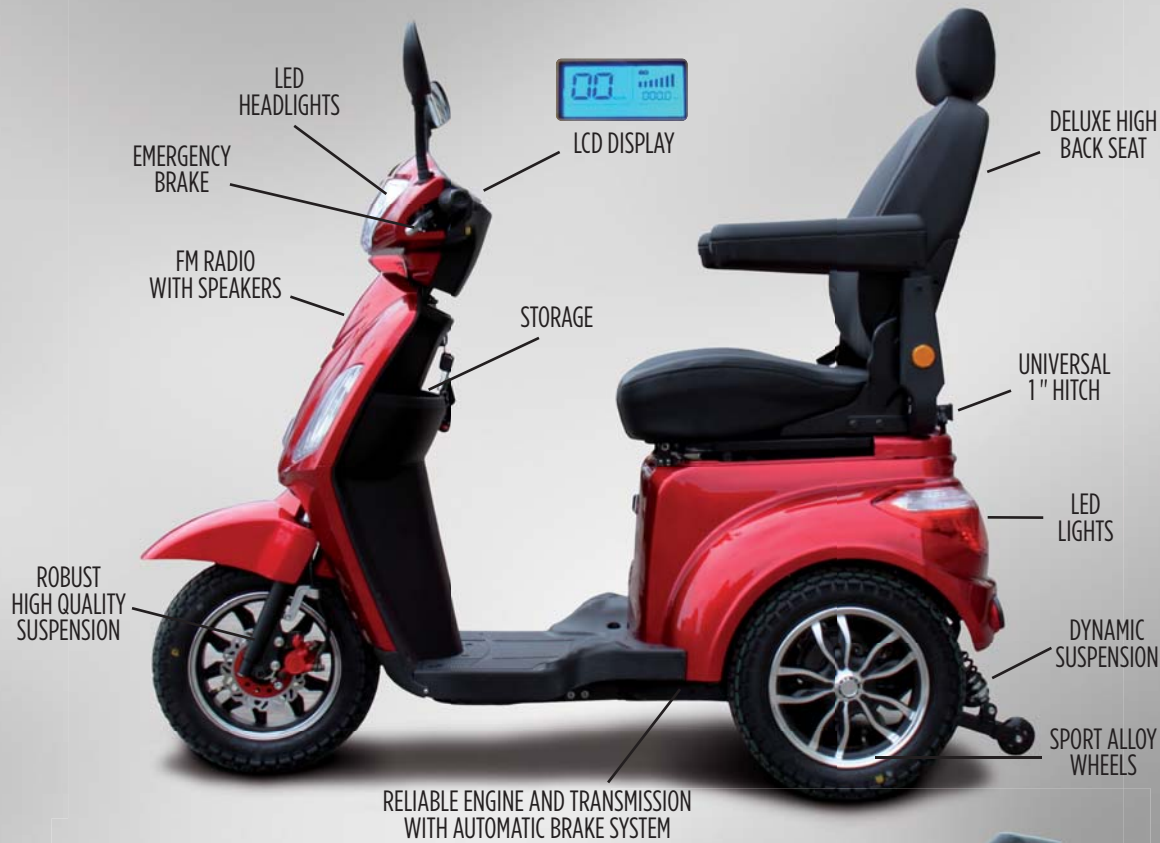
RELIABLE ENGINE AND TRANSMISSION WITH AUTOMATIC BRAKE SYSTEM