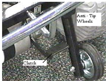
Clutch = Manual lever