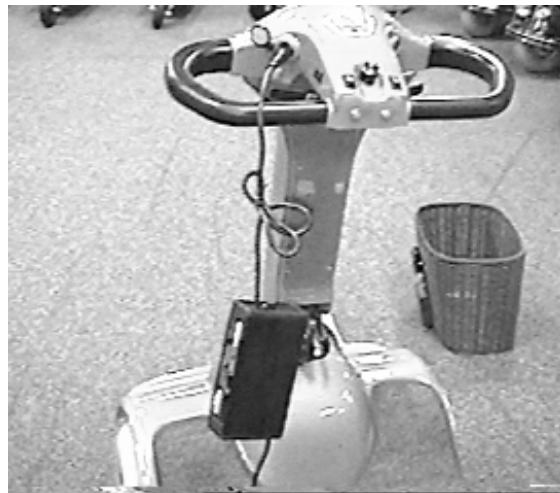
Battery Charger Hook up