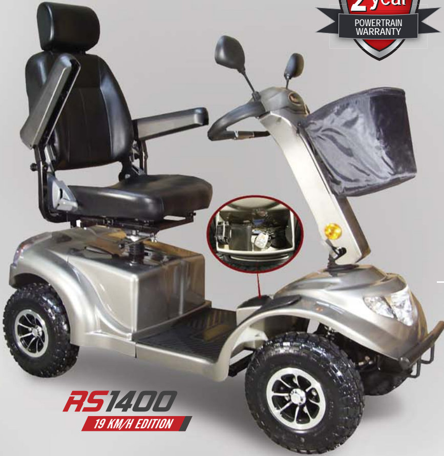
RS1400 19 KM/H EDITION