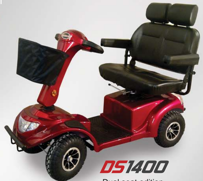
DS1400 Dual seat edition

The RS1400 is definitely your best choice!